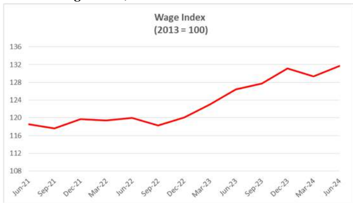
Chart 4: Wage Index, Jun 2021 - Jun 2024

Chart 4 above shows the trend in the wage index from June 2021 to June 2024. As shown, the index recorded an aggregated increase of 4.2% for the June 2024 quarter compared to the same quarter of the previous year. The main industries which contributed significantly to this recorded increase in wage index includes Food manufacturing, Accommodation, Agriculture, Restaurants, Construction, Other manufacturing, Water, Commerce and Electricity with respective growths of 31.8%, 21.8%, 21.0%, 16.3%, 15.3%, 14.0%, 10.8%, 8.9% and 8.7% compared to the June 2023 quarter.